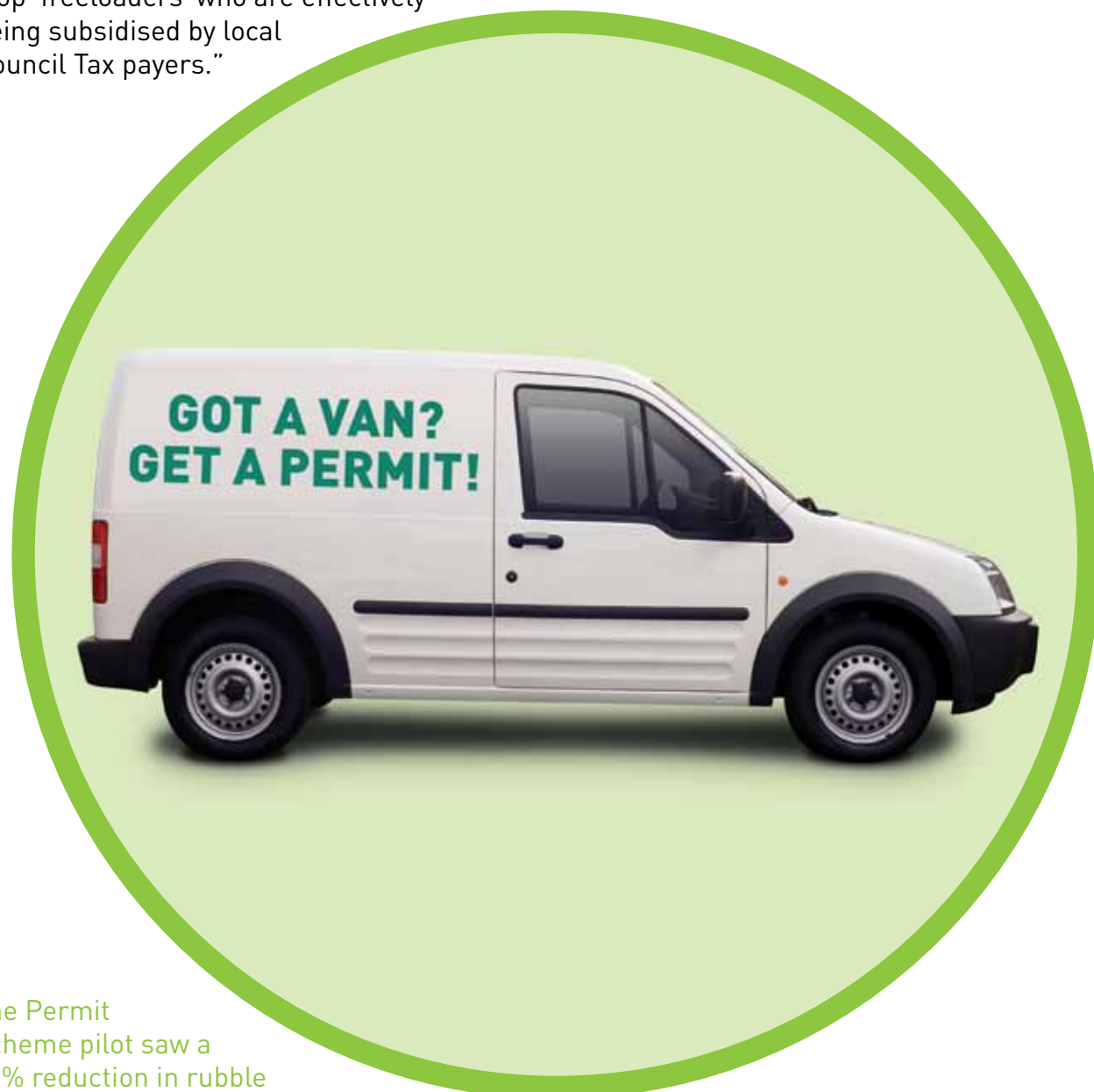
The Permit Scheme pilot saw a 26% reduction in rubble

It is estimated that the Permit Scheme will ultimately pay for itself, with savings achieved by reduced landfill costs more than covering the cost of operating the initiative. The Scheme will soon also roll out to Knowsley and St Helens.