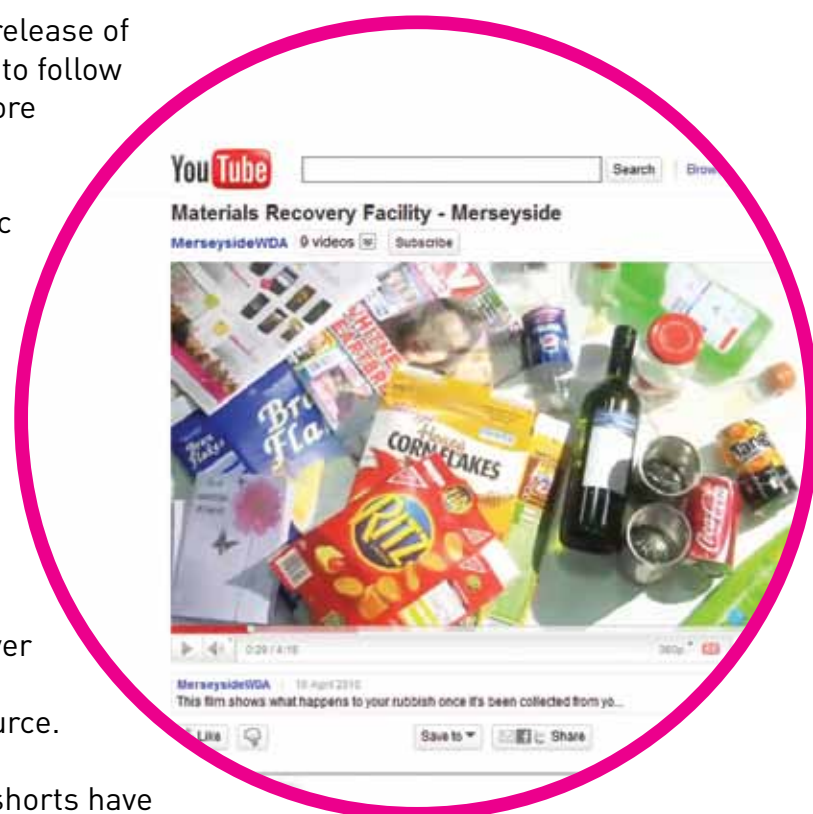
Showcasing the work of MWDA on YouTube