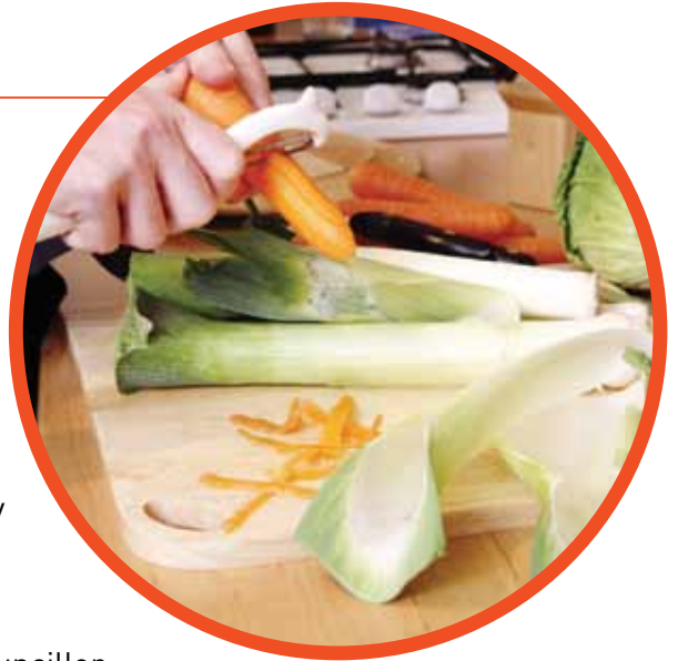
Food waste makes up almost a third of our bins

is paper and another 10.4% is known as miscellaneous combustibles – everything from treated wood to used nappies and old carpet