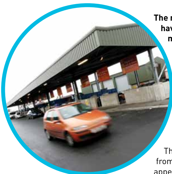
South Sefton Household Waste Recycling Centre