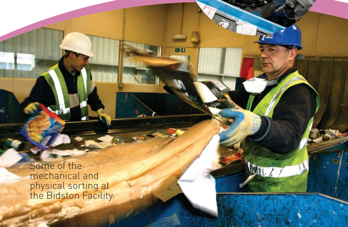
Some of the mechanical and physical sorting at the Bidston Facility