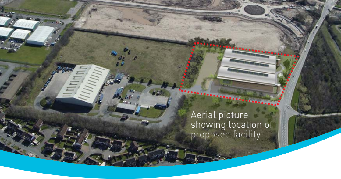
Aerial picture showing location of proposed facility