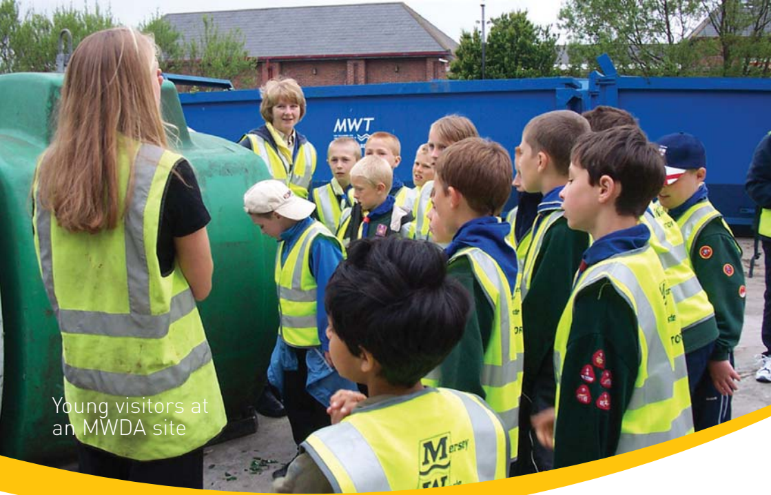
Young visitors at an MWT site