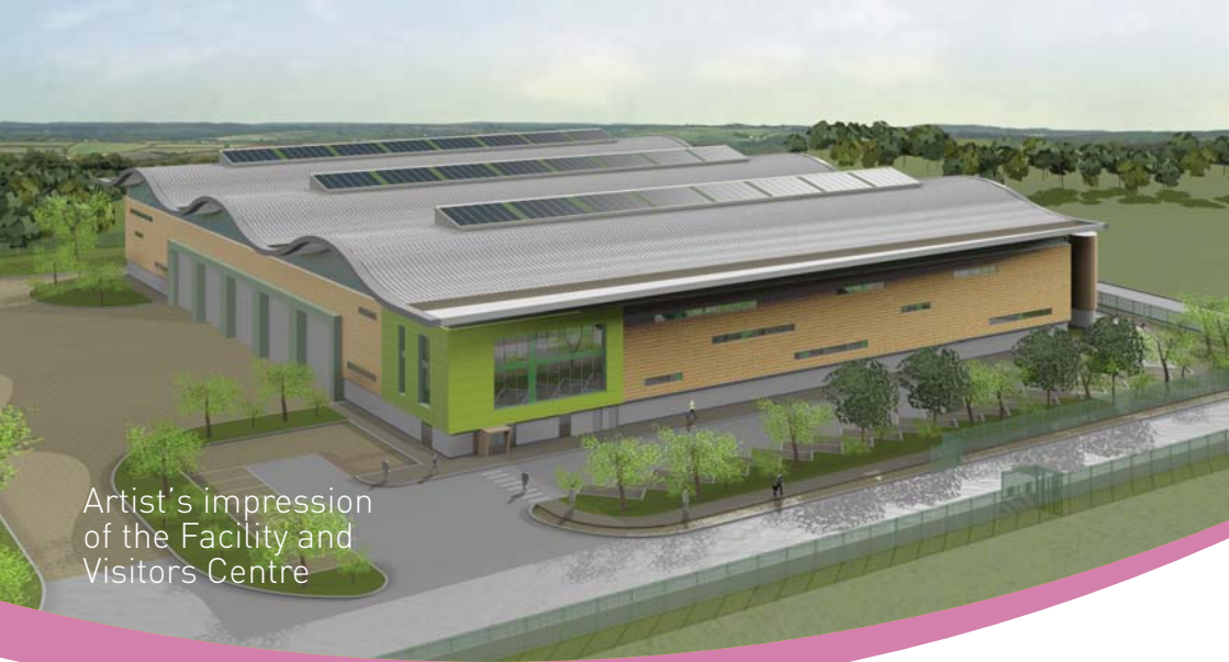
Artist's impression of the Facility and Visitors Centre