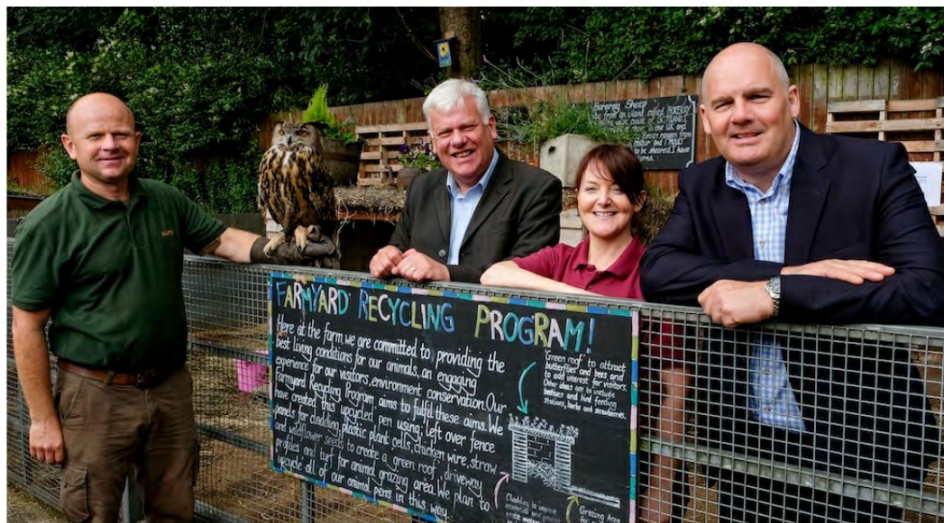
Home Farm at Croxteth Park - part of the 2017/18 Community Fund

Successful applicants have been awarded up to £25,000 for schemes which operate across Merseyside and Halton, and up to £8,000 for projects which work solely at local authority level.