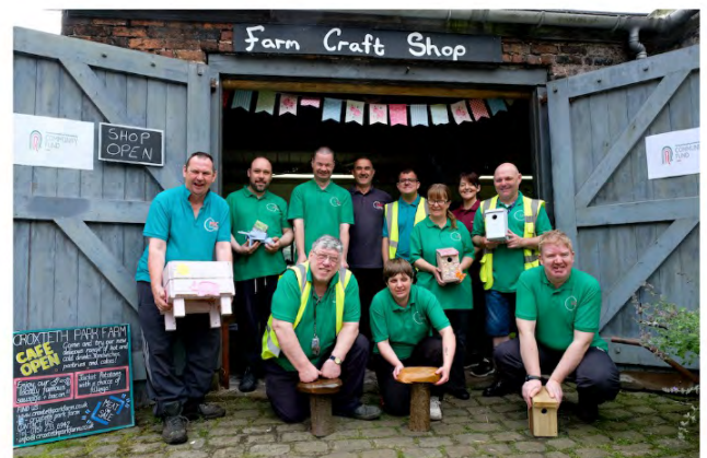
The Craft Shop at Home Farm